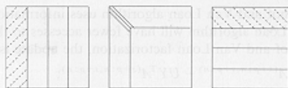
Fig. 1. Partitioned matrix.

We use the block reduction algorithm as described above to introduce zeros in a block of the matrix; say we are at the k th stage and have just introduced zeros into the k th block. As we start the next block reduction, on the k+1 st block, we can start in parallel the eigenvalue computation on that part of the tridiagonal matrix generated from the k th block reduction of the matrix. When we have completed eigenvalue computations from two tridiagonal segments, we can use the technique applied in the divide and conquer algorithm as described by Dongarra and Sorensen [11] to determine the eigenvalues and eigenvectors of a pair of tridiagonal matrices. Then the eigenvalues of successive pairs of blocks can be found, then pairs of pairs, etc., until the full set is determined. When the reduction to condensed form and the divide and conquer strategy are used in this pipelined fashion, a highly efficient parallel algorithm can be constructed.